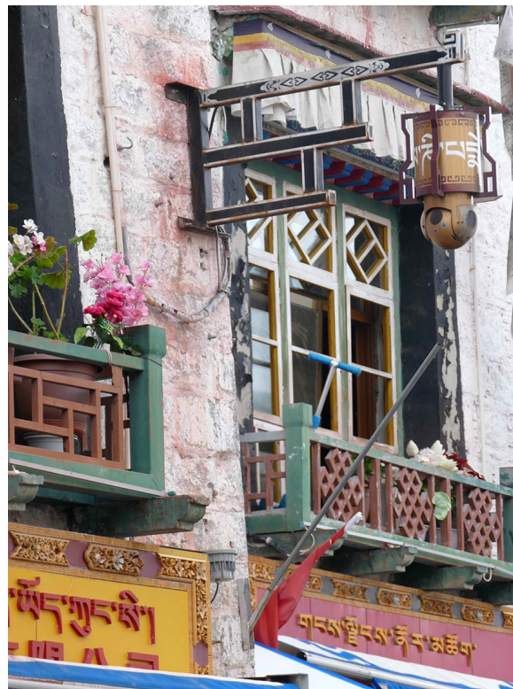
Surveillance camera disguised as a prayer wheel in the Barkhor area.

Given the high political priority ascribed to compliance with top-down planning policy, the recent Chinese State Council response on Lhasa city planning emphasized that enhanced surveillance was in place, if Lhasa citizens had any doubt: “The ‘Overall Plan’ is the fundamental basis for the development, construction and management of the city of Lhasa, and all construction activities within the urban planning district must comply with the requirements of the ‘Overall Plan’. [...] Strengthen mass and social supervision, and raise awareness of social respect for urban planning. All Lhasa-based work