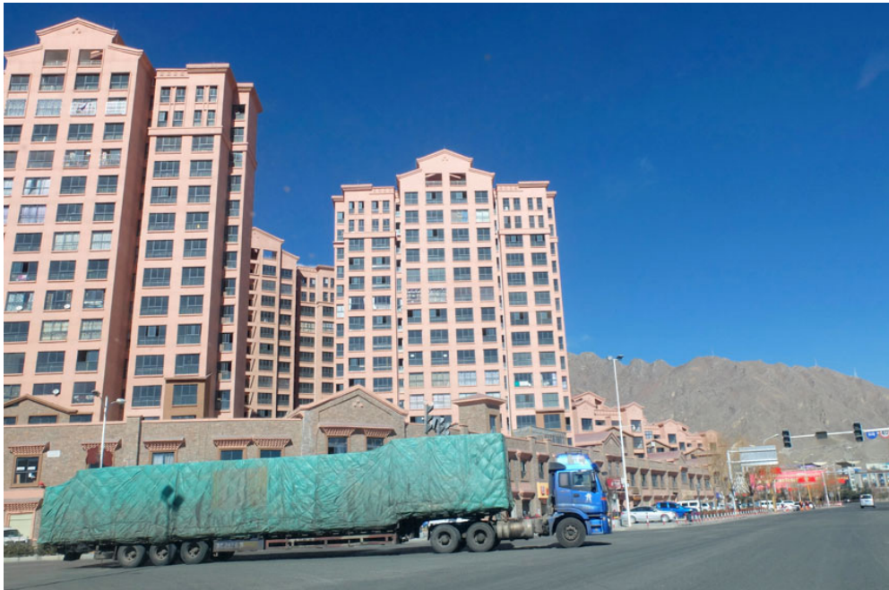
New construction in the Toelung area of Lhasa. The building of the railway station in 2005 involved the relocation of local residents in the area of Ne'u (Chinese: Liuwu) township in Toelung Dechen county (Chinese: Duilongdeqing). (International Campaign for Tibet report 'Tracking the Steel Dragon').