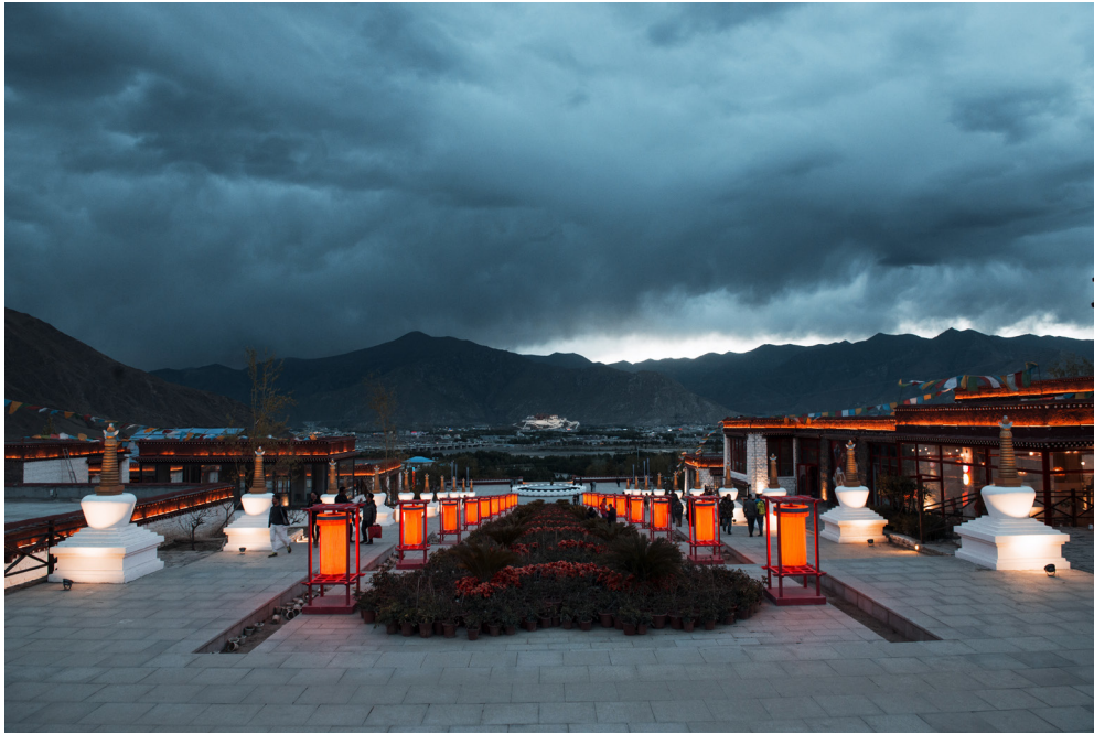
The Princess Wencheng spectacle opposite the Potala Palace. The multi million dollar spectacle is a state-scripted narrative in which the Chinese, embodied by Princess Wencheng of the 7th century, ‘civilise’ the Tibetans and bring harmony to Tibet. It is designed to boost mass domestic tourism.