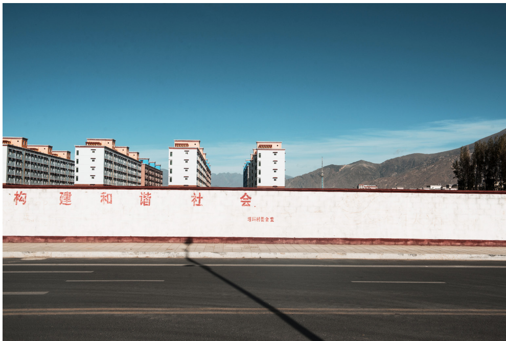
Slogan on a wall in front of new construction in Lhasa reads: "Construct a Harmonious Society".

China's development of Lhasa is an integral part of its policies of urbanisation in Tibet, which has been predominantly rural. Urbanisation is a key mechanism designed to meet economic objectives but with the political agenda of integrating Tibetans into the PRC, undermining 'ethnic autonomy' and ensuring top-down control. The intensified securitization in Tibet is dependent upon urbanisation as well as settlement of Tibetan nomads, because it makes Tibetans easier to administer and control, [50] as well as creating space for Chinese incomers.