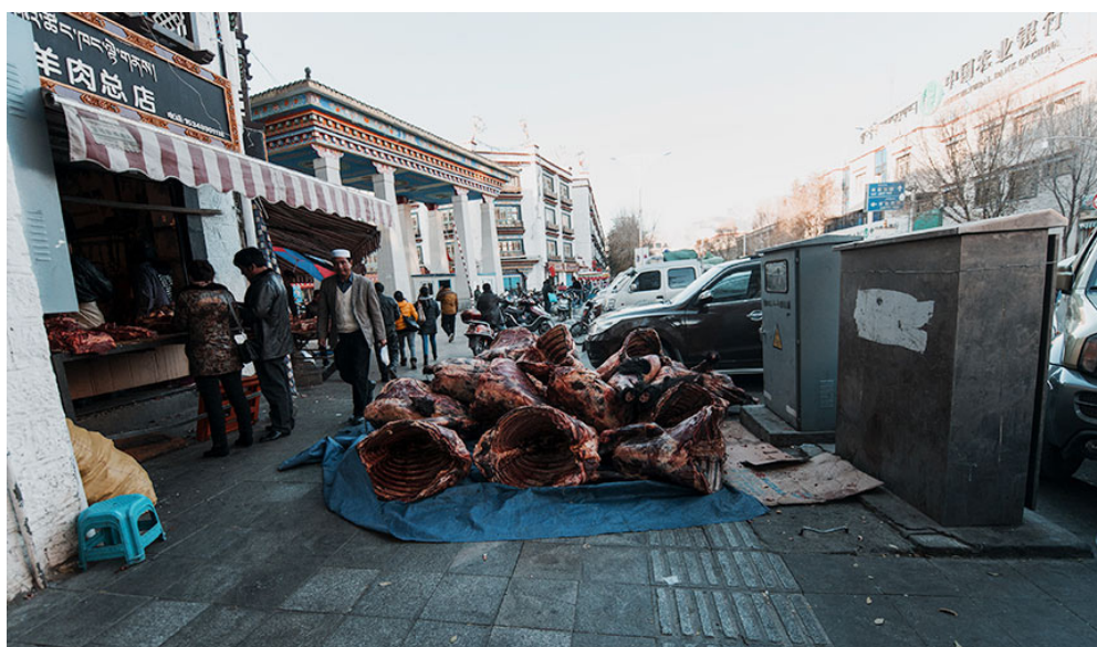
Chinese Hui Muslims selling meat on the streets of Lhasa.