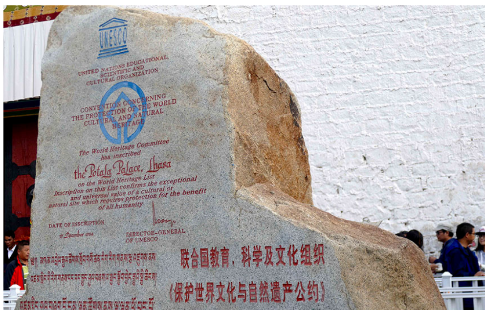
Commemorative stone marking the recognition of the Potala Palace as UNESCO World Heritage in Lhasa.

The three buildings were inscribed as UNESCO World Heritage in 1994, 2000, and 2001 respectively, and are described on the UNESCO World Heritage Committee website as follows: "The Potala Palace, winter palace of the Dalai Lama since the 17 th century, symbolizes Tibetan Buddhism and its central role in the traditional administration of Tibet. The complex, comprising the White and Red Palaces with their ancillary buildings, is built on Red Mountain in the center of Lhasa Valley, at an altitude of 3,700m. Also founded in the 7 th century, the Jokhang Temple Monastery is an exceptional Buddhist religious complex. Norbulingka, the Dalai Lama's former summer palace, constructed in the 18 th century, is a masterpiece of Tibetan art. The beauty and originality of the architecture of these three sites, their rich ornamentation and harmonious integration in a striking landscape, add to their historic and religious interest." [6]