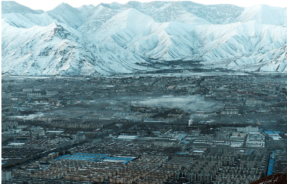
Recent cityscape, Lhasa.