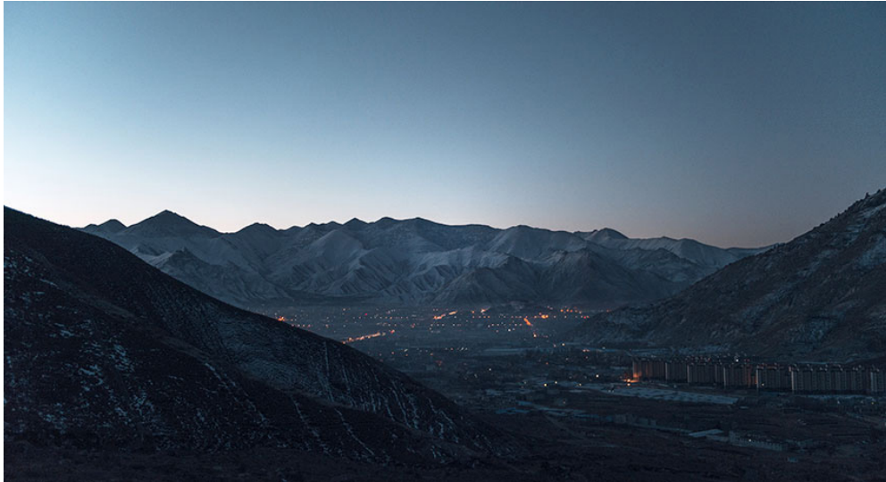
Cityscape at night, showing new developments in the foreground.