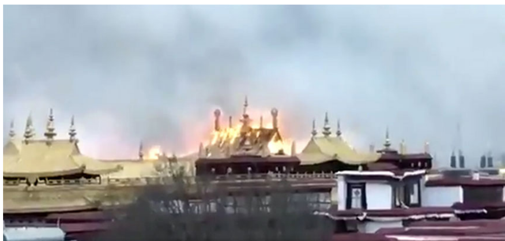
This image of the blaze at the holy Jokhang Temple on February 17, 2018, was captured on social media and circulated online before Tibetans were warned not to send news of the fire outside Tibet.

On the second day of Tibetan New Year, February 17 (2018), a fire broke out in the most sacred temple of Tibet, the Jokhang in Lhasa, Tibet's historic and cultural capital. Videos emerged showing flames shooting from the golden roof of the temple, a place of unparalleled religious importance not only to Tibetans but also to Buddhists across the globe. In the background, the sound of Tibetans weeping in distress and praying could be heard. And then, silence. China's Party state suppressed any news about the fire and rebuffed attempts by international experts to ascertain the damage, even though the Jokhang is a UNESCO World Heritage site. In a telling admission, Tibetans posted emojis of faces with gagged mouths.