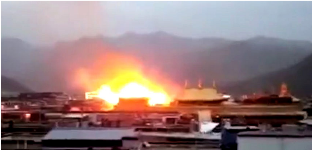
This image of the blaze at the holy Jokhang Temple on February 17, 2018, was captured on social media and circulated online before Tibetans were warned not to send news of the fire outside Tibet.