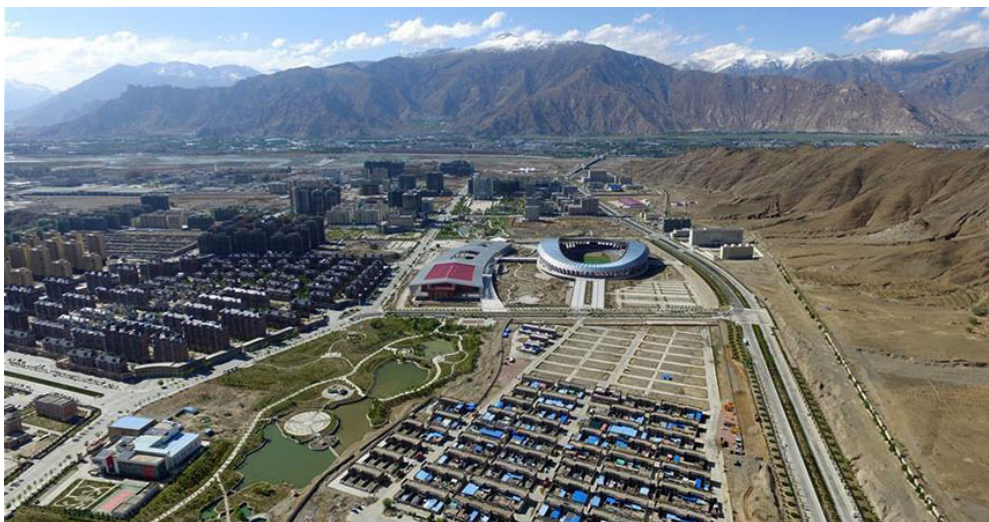
New construction in the Tibetan village of Drip, that has resulted in relocations. One Tibetan reported losing all his farmland when the Princess Wencheng spectacle for Chinese tourists opened opposite the Potala Palace.

Tibetan writer Tsering Woeser is one of the most eloquent and astute writers on the transformation of the city of Lhasa, from the Cultural Revolution – when her father was an official photographer – to today. She says: "Comparing today with the Cultural Revolution, there were no believers kneeling back then, and the temple was ruined, while today the temple offers a bustling scene where believers may freely worship. But these are only superficial differences. Religious worship is still strictly controlled. Furthermore, there is now commercialized tourism, with gawking tourists who treat Tibetans like exotic decorations and Lhasa as a theme park." [63]