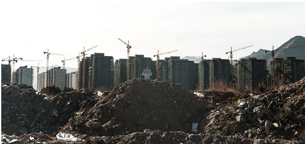
New construction to the east of Lhasa.

The Chinese authorities have sought to 're-brand' Tibet as a grid of tourist itineraries. The creation of a series of 'tour circuits' has been backed up by massive infrastructure investment funded by Beijing, not only the railway to Lhasa and Shigatse, but also regional airports giving tourists glimpses of Tibet's variety of landscapes, architecture, wildlife and heritage.