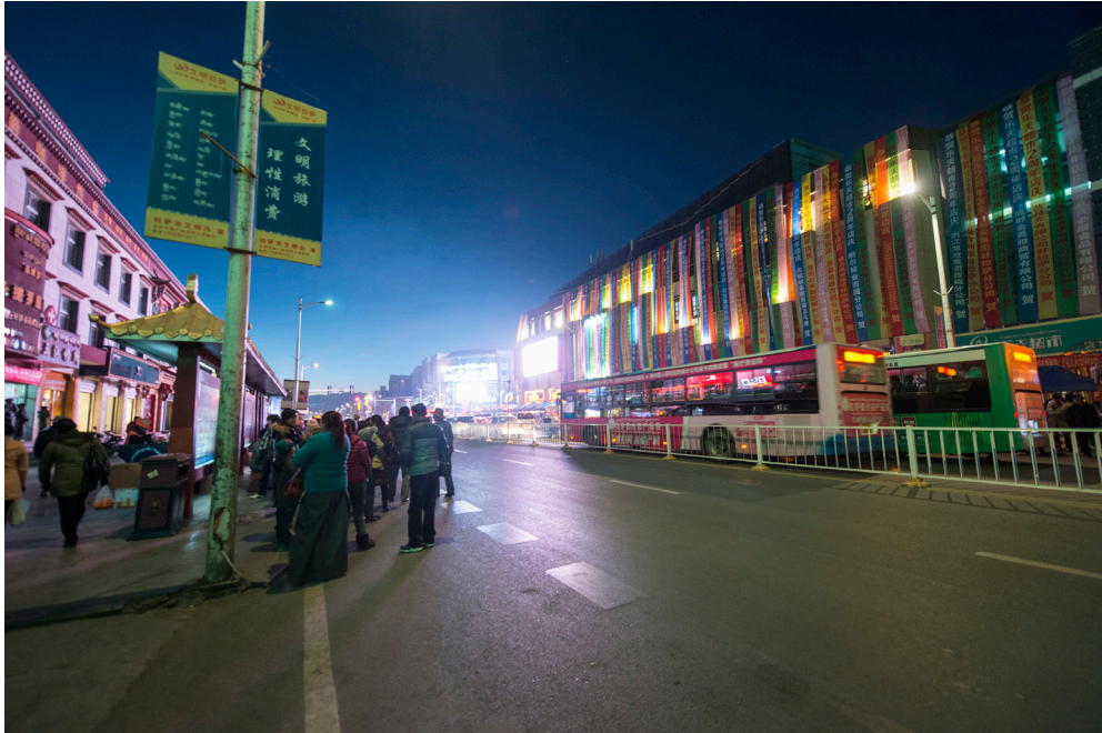
Time Square, Lhasa's latest shopping mall on Beijing Rd, near the Potala Palace. The center includes a large supermarket, cafes and stores selling Chinese and Western brands.

Lhasa is critical to China's 2010-2020 tourism strategy, which names the two main markets as "human culture tourism" and "ecotourism", with "boutique tourist routes" and "safari tourism" for adventurous travellers seeking wild landscapes.