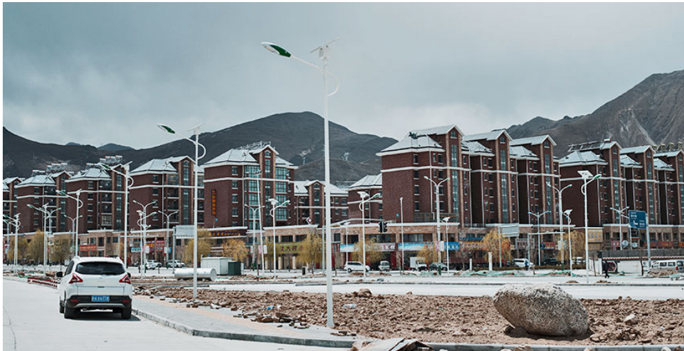
Newly built apartments in the west of Lhasa.