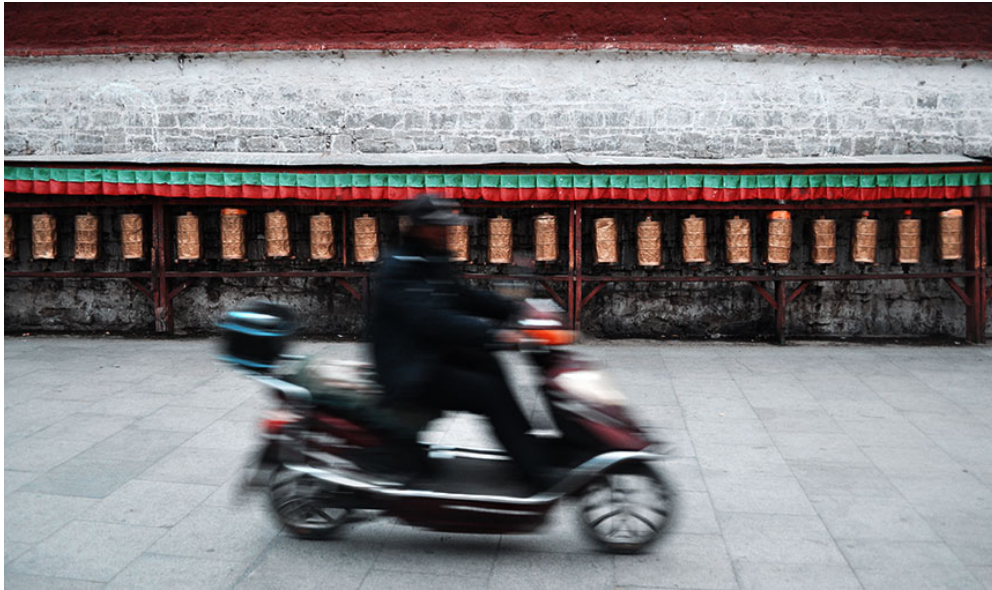
A Tibetan motorcyclist rides around the Potala Palace.