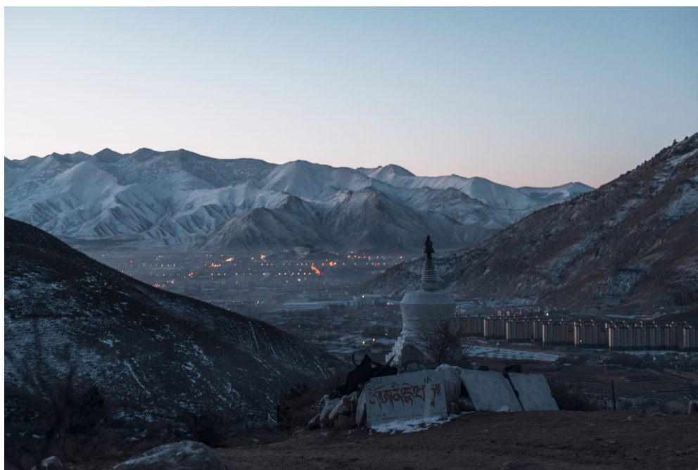
New developments can be seen beyond a stupa at Pabongkha monastery.

Departments together with UNESCO to ensure that conservation objectives are met and the integrity of the World Heritage Sites preserved. Furthermore, they should give strict guidelines to ensure that the sites' integrity and authenticity are protected.” [69]