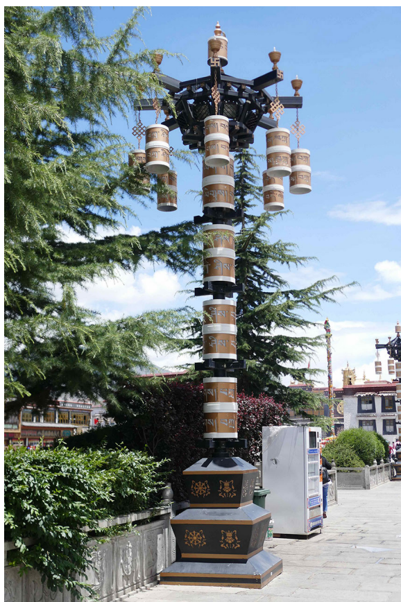
This image, which was taken before the Jokhang fire in February, shows the 'Tibetan-style' streetlights outside the temple.

In one of its only references to protecting culture of the city, a Chinese State Council document on Lhasa's urban planning states not that buildings must be preserved, but that the Chinese authorities must "protect the traditional style and configuration of the city, particularly in the historical urban districts". This is a direct reference to new buildings that have been constructed in Tibetan style. [28]