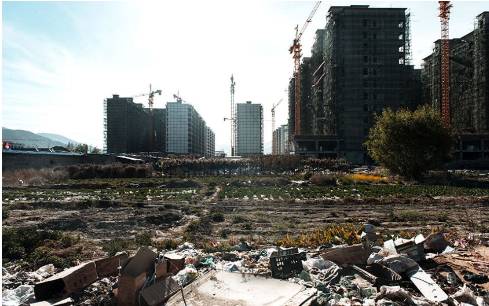
New construction, Lhasa.