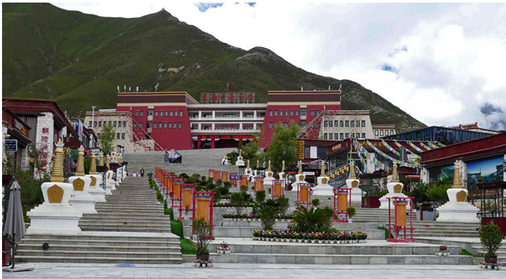
The Princess Wencheng spectacle entrance in eastern Lhasa. Tibetan writer Tsering Woeser wrote in 2014: “For many years, supported by power and money, these kinds of projects have been blossoming everywhere, sweeping everything away. One can predict that this commercial theatre play put on stage in a fake Potala Palace will be a must-see of future tourist groups visiting Lhasa. They can brainwash people and make money at the same time. Those that will be harmed, however, are the Tibetans who have been invaded and deprived of their history.” ( http://highpeakspureearth.com/2014/a-fake-potala-palace-and-the-myth-of-princess-wencheng-by-woeser/ )

In 2013, more than 200 scholars in countries across the world voiced strong concern about a project to modernize the historic center of Lhasa linked to the development of tourist infrastructure. “This destruction is not simply a matter of aesthetics,” said the petition, addressed to China’s president Xi Jinping and to UNESCO director-general Irina Bukova. “It is depriving Tibetans and scholars of Tibet