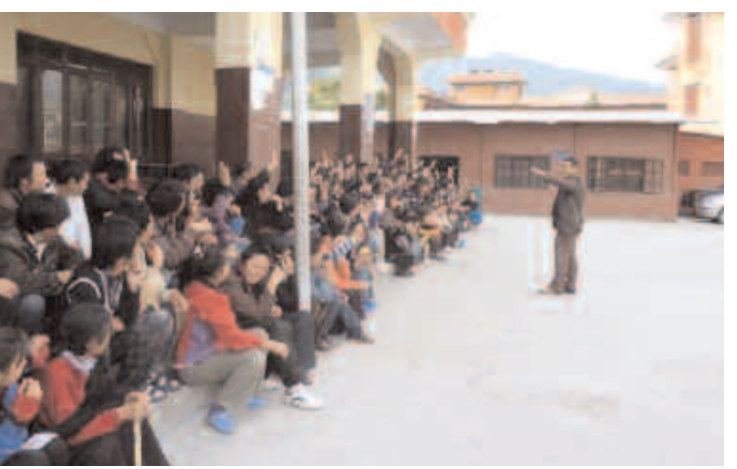
The director of the TRRC addresses a group of new arrivals in front of the main building. In recent years approximately 2,500 to 3,500 Tibetan refugees would make the dangerous crossing over the Himalayas into Nepal and onward to India. However, since the Chinese crackdown following the Tibetan protests that began in March, 2008, the number has dropped dramatically, with only 838 Tibetans making the journey in 2009.