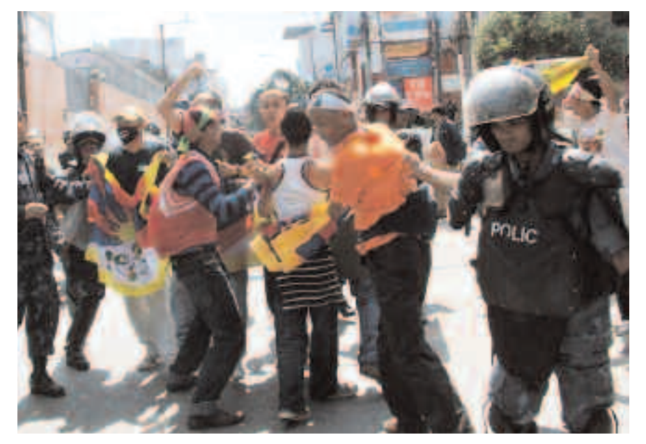
Tibetans protesting in Kathmandu on October 1, 2009. In anticipation of Tibetan protests in Kathmandu in 2009, according to information received by ICT, on March 8 and 9, 2009 up to 25 prominent Tibetans who were suspected of playing a leading role in protests in Kathmandu in 2008 were detained by Nepalese police, in some cases during police searches of their homes without providing warrants or reasons for the detentions. The detentions took place prior to the customary March 10 anniversary gathering due to take place.

It is believed that the treaty will serve to codify Nepal's pledged 'One-China' policy, further signaling to the Tibetan community who arrived in Nepal after 1989 that their already tenuous status in Nepal is in greater danger.