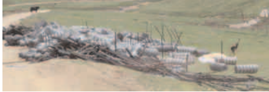
The Chinese authorities are implementing a policy of fencing off grasslands in many areas of eastern and central Tibet, as part of their intention to settle nomads and end the nomadic way of life. For a very low compensation Tibetan herders are often required to erect fences themselves in order to limit the mobility of their livestock. This image was taken in Kham, eastern Tibet, in August 2007 and depicts bales of wire that have been left in the grasslands for herders to fence off the pastures. Burdened with low economic prospects, a number of Tibetans choose to leave Tibet each year for a life in exile in the hopes of greater economic opportunities.

The PRC cites increased investment and material development in Tibetan areas as a means of improving the lives of Tibetans. While these benefits penetrate Tibet's geographical borders, the majority of it does not reach the Tibetan people, but rather lands with Chinese companies and workers who come from central China to earn a living from the government's investment in the bureaucratic administration of Tibetan areas, infrastructure development projects such as the Tibetan railway, and mining activities.<sup>61</sup>