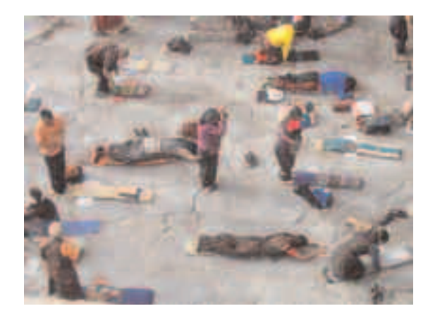
Tibetan religious devotees in front of the Jokhang temple in Lhasa, performing religious prostrations. Many Tibetans who leave Tibet in order to see the Dalai Lama or go on pilgrimage later return to Tibet, facing similar risks on their return journey.

Periods of political unrest have resulted with the implementation of new political campaigns or re-education and the implementation of measures that fail to take into account Tibetan priorities or reflect the unique Tibetan identity. Tibetan parents take enormous risks to send their children to Tibetan schools in India in the hopes they will receive a Tibetan education that is now rare in Tibet. Today, the best opportunity for a quality education for a Tibetan student who does not make the journey into exile is through schools in central and eastern China. Parents who have the means send their children to these schools in the hopes that they will be better prepared to compete in the rapidly expanding Chinese economy.