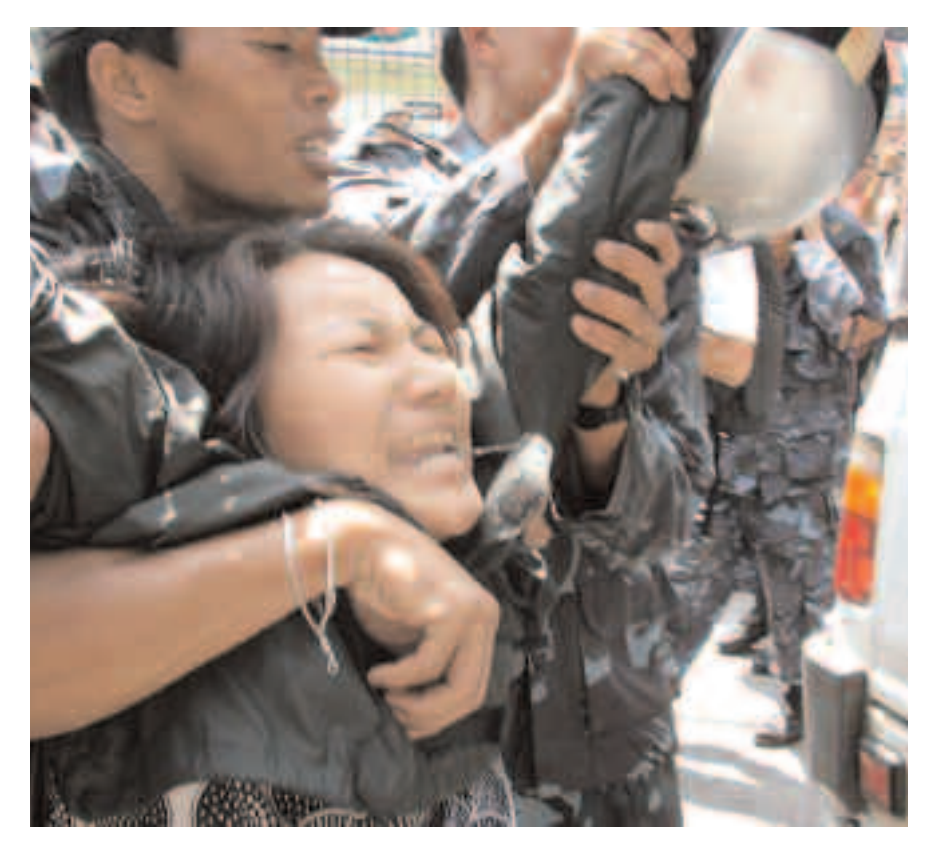
A Tibetan protestor being detained following a demonstration in Kathmandu on October 1, 2009, the anniversary of the Chinese Communist Party's ascendency to power in China. While foreign governments and international institutions engaged the Nepal government in advance of March 10 to urge restraint in dealing with Tibetan protestors, the Chinese authorities made it clear that they expected Nepal to impose the same limits on civil and political rights imposed on Tibetans in Tibet.

has taken strong and effective measures to successfully foil the attempts of so-called 'Tibet independence' activists to conduct all kinds of sabotage and disruptive activities targeted at the Chinese Embassy in Nepal and other establishments on China's territory, and ensured the security and proper order of the Chinese Embassy. We highly appreciate that."<sup>23</sup>