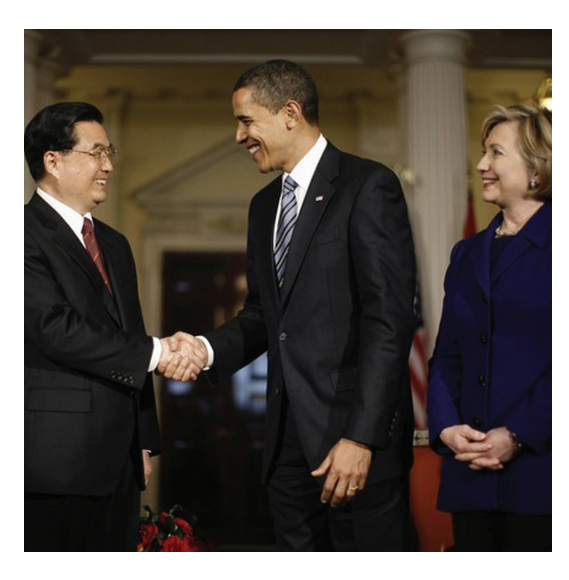
Presidents Hu and Obama, and Sec. of State Clinton meet on the margins of the G20 Summit in London, April 2009

More recently, on March 31, the European Parliament made a strong statement condemning the current crackdown in Tibet and called on the Chinese government to re-open sincere and result oriented dialogue with the Dalai Lama's envoys based on the basis of the Memorandum on Genuine Autonomy presented by the Tibetan representatives during the eighth round of dialogue. The statement said, "[The E.U.Parliament] ... strongly condemns the crackdown against Tibetans following the wave of protests that swept across Tibet beginning on 10 March 2008 and the repression by the Chinese government that has increased in Tibet since then, and calls for the restart of a sincere and results-oriented dialogue between both parties based