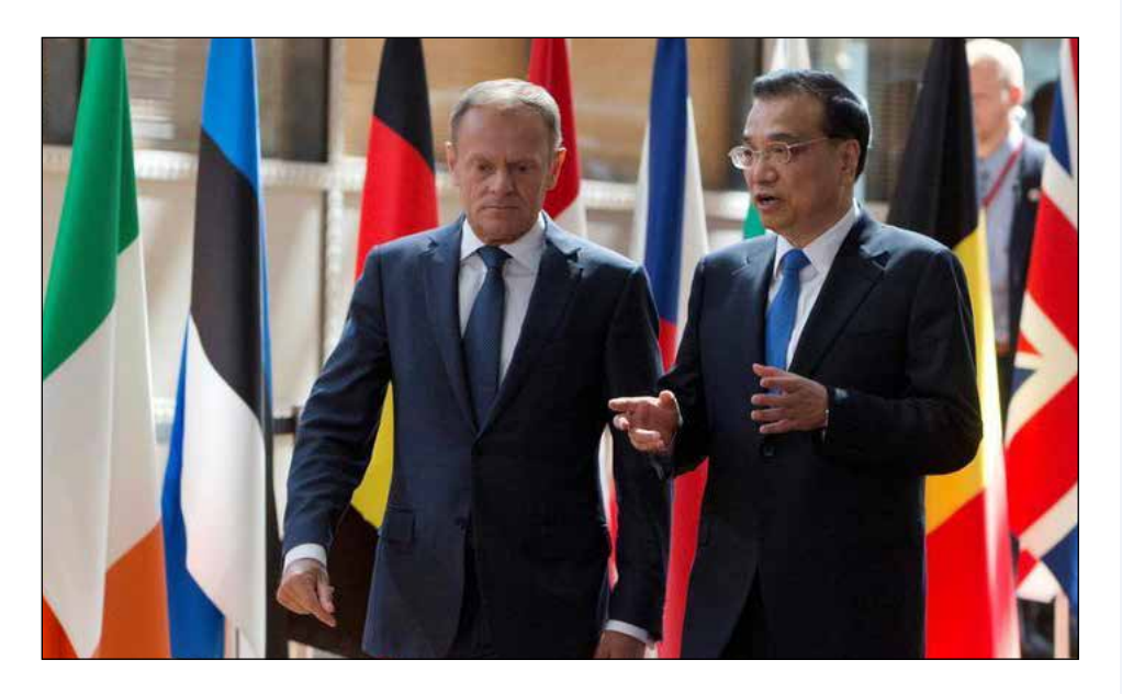
European Council President Donald Tusk and Chinese Premier Li Keqiang arrive at the EU-China Summit in Brussels on 2 June .

The 19<sup>th</sup> bilateral Summit between the European Union and China took place on 2 June in Brussels. It was followed by the 35<sup>th</sup> round of the EU-China Human Rights dialogue, which was held in the Belgian capital on 22 and 23 June.