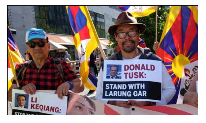
Members of the Tibetan Community in Belgium at the rally in the margins of the EU-China Summit on 2 June.

The EU-China Summit was followed on 22 and 23 June by the 35<sup>th</sup> round of the EU-China Human Rights dialogue, which consisted of the dialogue itself and a roundtable discussion between European and