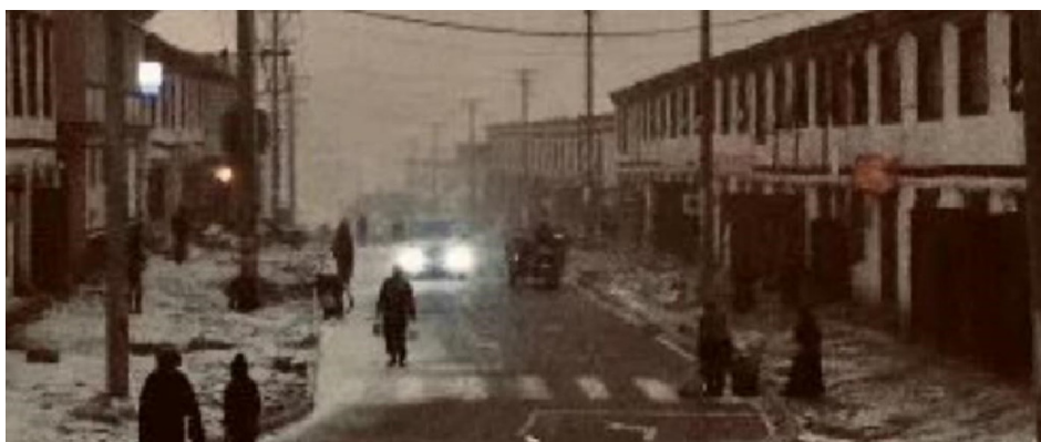
The main street of Wonpo, in Serushul, in late November following the protests and crackdown.

MORE THAN 30 TIBETAN MONKS AND LAYPEOPLE WERE IMPRISONED FOR TWO WEEKS IN A HARSH CRACKDOWN IN SERSHUL (CHINESE: SHIQU) IN EASTERN TIBET, FOLLOWING THE ARREST OF SEVEN TIBETANS THERE FOR PROTESTS IN NOVEMBER.