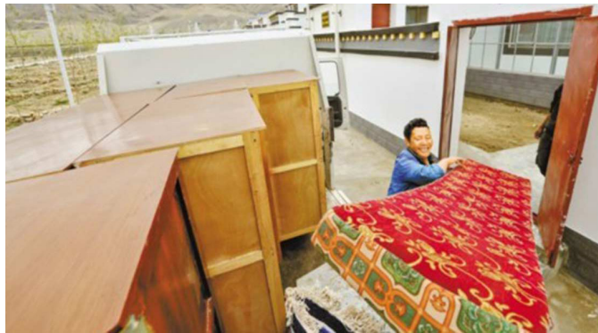
An image from Chinese state media shows a family moving into a house in Demchog, a new "xiaogang" border defense village, in August 2019.

CHINA HAS ACCELERATED CONSTRUCTION OF NEW "BORDER DEFENSE VILLAGES" IN TIBET THIS YEAR AS PART OF THE FAR-REACHING AGENDA OF PRESIDENT XI JINPING TO CREATE AN ADVANCED, IMPENETRABLE "SECURITY BARRIER" BETWEEN TIBET AND THE OUTSIDE WORLD.