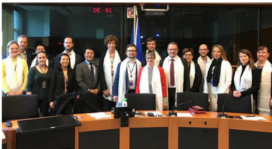
Some of the participants at the Tibet Interest Group meeting in the European Parliament on 22 January 2020.

THE FIRST MEETING OF THE EUROPEAN PARLIAMENT'S TIBET INTEREST GROUP (TIG) SINCE A NEW PARLIAMENT WAS ELECTED TOOK PLACE ON 22 JANUARY IN BRUSSELS. A NUMBER OF NEW MEMBERS SHOWED A STRONG MOTIVATION TO BE ACTIVE SUPPORTERS OF THE TIBETAN PEOPLE WITHIN THE PARLIAMENT.