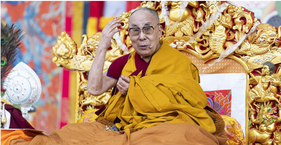
The Dalai Lama concluding teachings at Bodhgaya, Bihar in India, on 6 January.

IN NOVEMBER LAST YEAR, SENIOR TIBETAN RELIGIOUS LEADERS ADOPTED A RESOLUTION URGING THE DALAI LAMA TO REINCARNATE ACCORDING TO TIBETAN TRADITIONS. THEY DECLARED THAT TIBETANS WOULD NEVER ACCEPT A DALAI LAMA APPOINTED BY CHINA.