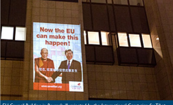
EU Council Building in Brussels illuminated by the International Campaign for Tibet

On the occasion of the Peace Nobel Prize Ceremony and the International Human Rights Day (10 December), the International Campaign for Tibet projected an image onto the EU Council building in Brussels of the Dalai Lama and Xi Jinping meeting in order to convey a strong message of the urgent need for such a meeting.