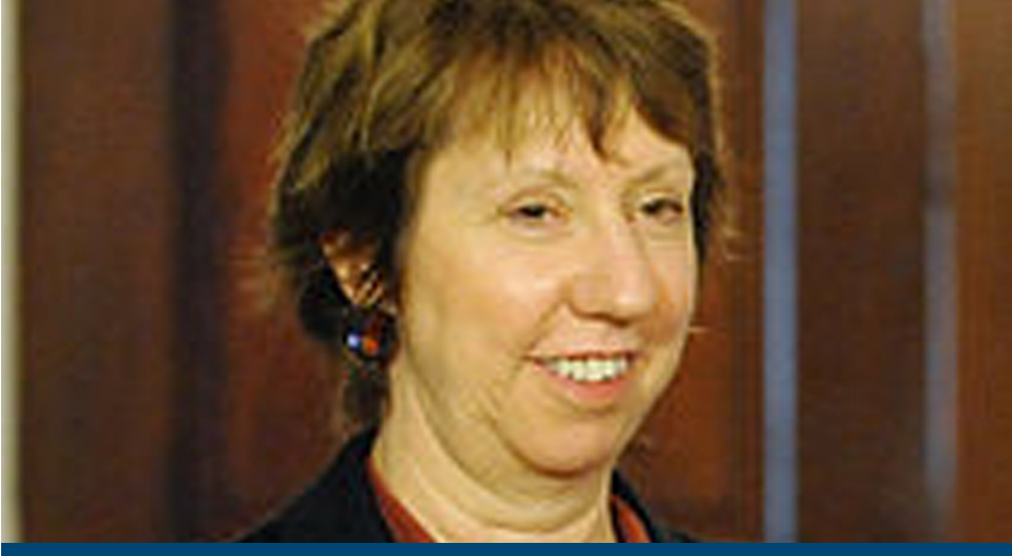
VPC/HR Catherine Ashton

On 14 December 2012 EU High Representative Catherine Ashton released <u>a declaration on behalf of the European Union</u> on Tibetan self-immolations. She expressed concern about the restrictions of Tibetan identity and called on the Chinese authorities to address the deep-rooted causes of the frustration of the Tibetan people. She also encouraged all concerned parties to resume meaningful dialogue.