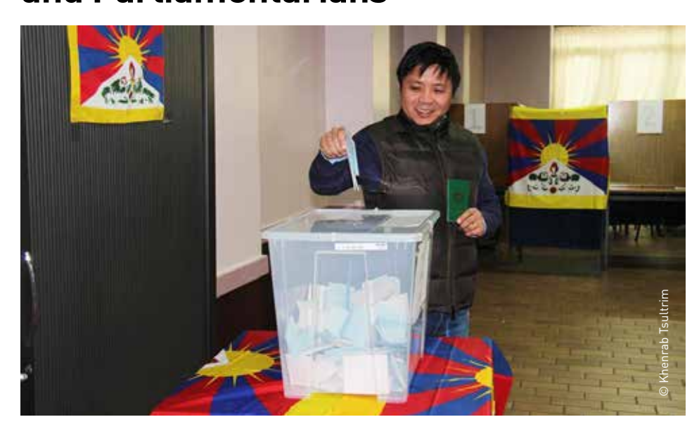
A man casts his vote during the Tibetan elections in Brussels.