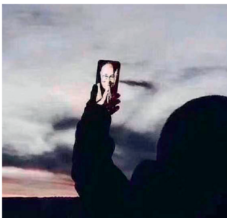
Tsering Woesser, a Tibetan writer and activist based in Beijing, shared several photos on social media of Tibetans celebrating the Dalai Lama's birthday.

DESPITE THE CHINESE GOVERNMENT'S BRUTAL CRACKDOWN ON DALAI LAMA SUPPORTERS INSIDE TIBET, BRAVE TIBETANS CELEBRATED THE RELIGIOUS LEADER'S BIRTHDAY IN JULY, WITH SEVERAL ARRESTED AS A RESULT.