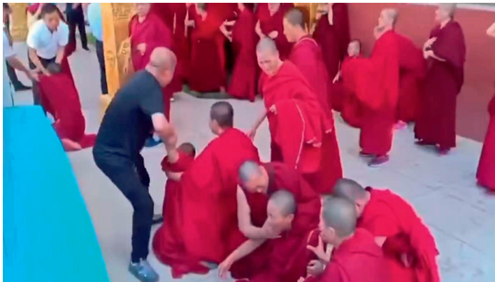
Officials in plain clothes forcibly remove nuns while others exit from the monastery's assembly hall.

LOCAL AUTHORITIES IN CHINA'S GANSU PROVINCE HAVE SHUT DOWN A TIBETAN BUDDHIST MONASTERY, FORCIBLY EVICTING THE MONASTICS AND ORDERING THEM TO DISROBE.