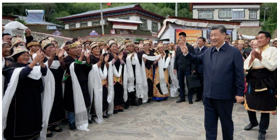
Chinese President Xi Jinping waves to villagers while visiting Galai village of Nyingtri in the Tibet Autonomous Region on 21 July.

IN THE FIRST CHINESE PRESIDENTIAL VISIT TO TIBET IN 30 YEARS, XI JINPING PAID AN UNANNOUNCED VISIT TO THE TIBET AUTONOMOUS REGION FROM 20-22 JULY, DURING WHICH HE URGED TIBETANS TO "FOLLOW THE PARTY".