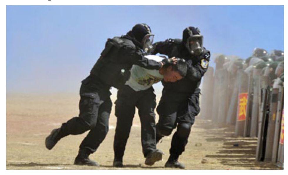
Police techniques for dealing with protestors being demonstrated at the Kardze counter-terrorist military drill. Image from Chinese state media.

On 27 December, 2015, China passed its first counter-terror law, rejecting concerns from international governments that draconian measures in the name of national security are being used to crack down on Tibetans, Uyghurs and Chinese civil society, and to undermine religious freedom.