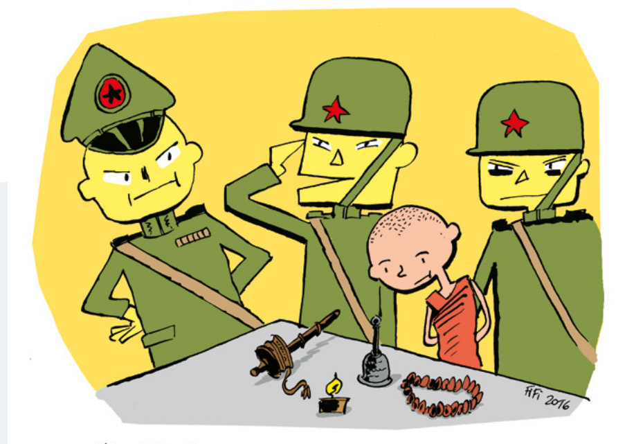
HE WAS PROBABLY PLANNING A TERRORIST ATTACK