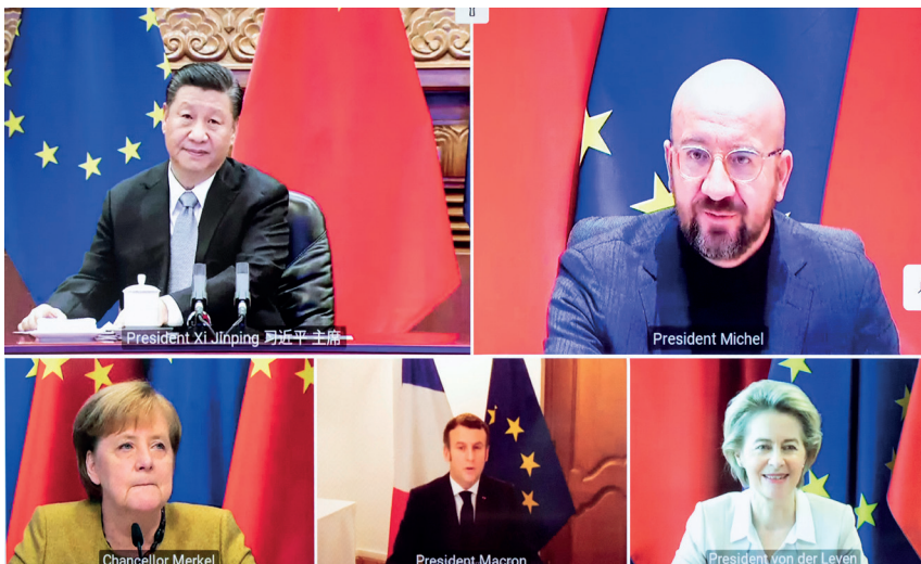
Chinese president Xi Jinping and EU leaders during the videoconference on 30 December.

AT THE END OF LAST YEAR, THE EUROPEAN UNION AND CHINA CONCLUDED NEGOTIATIONS FOR A COMPREHENSIVE AGREEMENT ON INVESTMENT (CAI), DESPITE STRONG CONCERNS ABOUT THE DEAL'S HUMAN RIGHTS IMPLICATIONS.