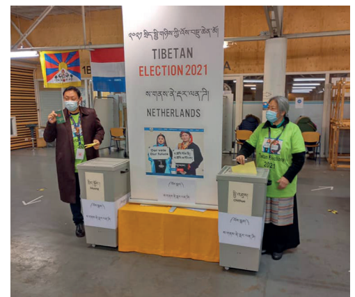
Tibetans cast their votes in the Netherlands on 3 January.

After the second ballot on 11 April, votes will be counted locally from 13 to 19 April, and the overall results will be announced on 20 May. The swearing-in of the newly elected parliamentarians is scheduled for 28 May, while the new Sikyong's swearing-in is expected a few days later.