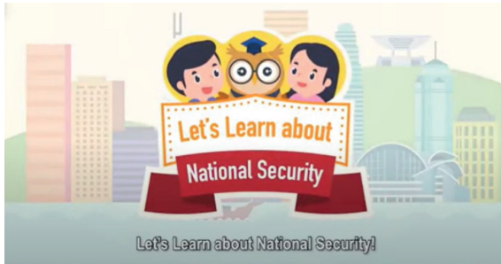
A screen grab from the Hong Kong Education Bureau's national security video for primary school children.

IN ITS LATEST BID TO ENTRENCH SECURITIZATION, THE CHINESE GOVERNMENT HAS RELEASED POLITICAL TRAINING GUIDELINES FOR A WHOLE NEW GENERATION OF VIGILANT GUARDS ACROSS CHINA.