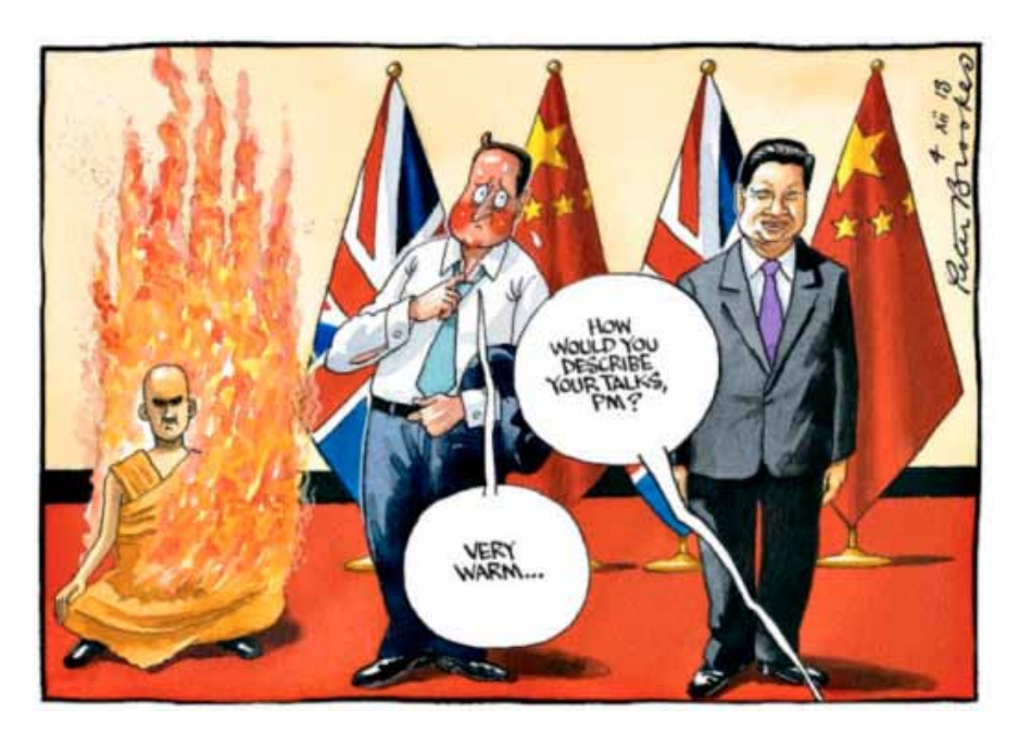
Cartoon: London Times

Despite UK Prime Minister (PM) David Cameron's conciliatory approach to the Chinese authorities and assertions that he had no plans to meet the Dalai Lama again, as his Beijing visit ended on December 4, 2013, the Chinese state media characterised Britain as an insignificant old country useful only 'for travel and study'.