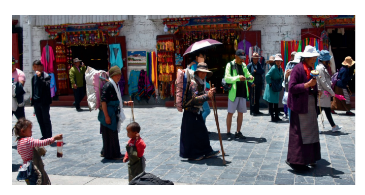
Pilgrims in Lhasa.

Chinese authorities therefore seem to be using the pandemic situation as a pretext to further reduce space in which Tibetan Buddhists can practice their faith. In past years, the Chinese authorities have already <u>imposed restrictions</u> on Tibetan Buddhists' religious activities during Saga Dawa.