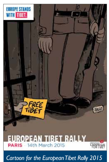
Cartoon for the European Tibet Rally 2015

March 10, 2015 was the 56th anniversary of the Tibetan Uprising leading to the Dalai Lama’s flight into exile in 1959, and the seventh anniversary of an unprecedented wave of protests, which swept through Tibet, only to be met by a violent crackdown. This year’s March 10 anniversary had a particular resonance as the Dalai Lama will turn 80 this year, a moment of particular significance to Tibetans . ■