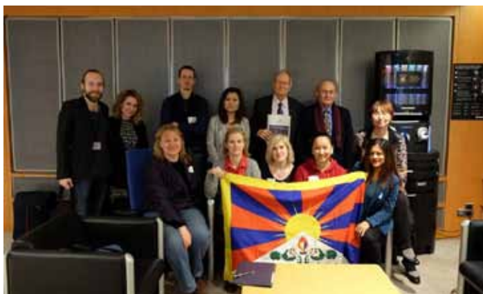
Lobby Days 2015 participants and ICT Brussels staff with MEP Tunne Kelam in the EP

The third European Lobby Days, organized by the International Campaign for Tibet Brussels (ICT) , were held in Brussels on March 2 and 3, 2015.