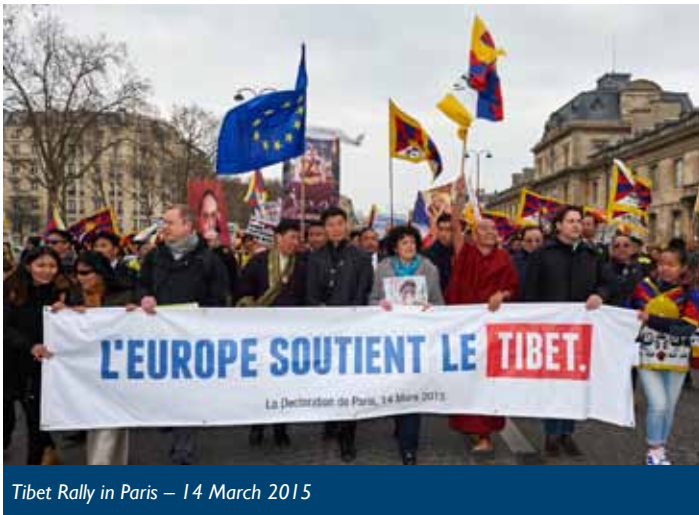
Tibet Rally in Paris – 14 March 2015

The International Campaign for Tibet (ICT) co-organized a major rally for Tibet in Paris on March 14, 2015, to demonstrate solidarity with the Tibetan freedom struggle and the Dalai Lama in his 80th year. Approximately 8,000 Tibetans and their supporters from across Europe gathered in Paris for this event.