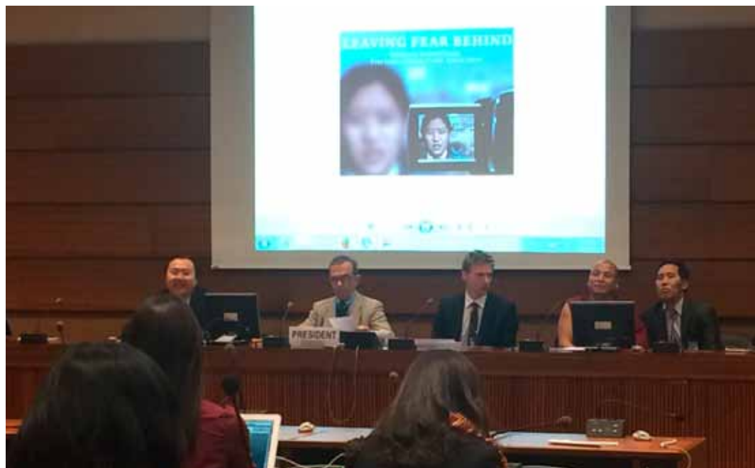
Side event on the human rights situation of minorities in China at the UN HRC – 16 March 2015

The International Campaign for Tibet (ICT) actively participated in the 28 th session of the UN Human Rights Council (HRC) in Geneva, which took place from March 2 – 27, 2015.