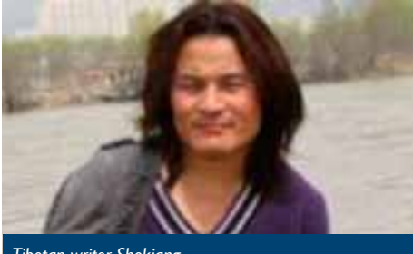
Tibetan writer Shokjang

"Gun-toting soldiers have surrounded Rebkong. They are frisking the Tibetans. Is this meant to protect public security? Or is this a deliberate ploy to provoke the people? If this is how they create the so-called social stability, how extremely terrifying this act is!"