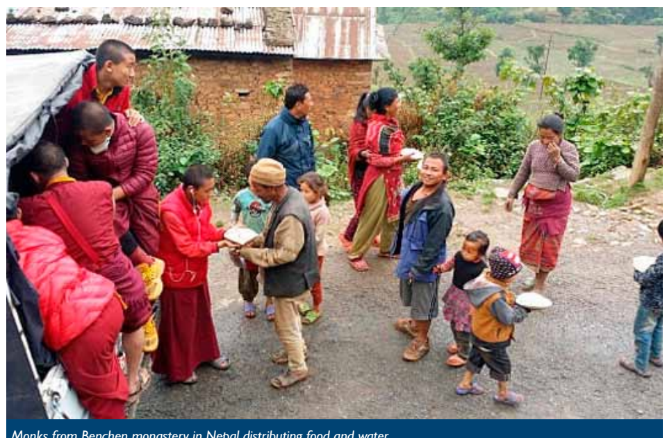
Monks from Benchen monastery in Nepal distributing food and water

Party Secretary Chen referred to a direct message from China's leader Xi Jinping in his comments, saying: "With the safety and well-being of the disaster area weighing heavily on the hearts of Secretary Xi Jinping and the Party central committee, and with the strong support of the central committee and national organs, the entire Autonomous Region Party, government, military, police and people will lead the first charge. This fully reflects the warmth of the motherland's great family and the advantages of the socialist system. When one area faces difficulties support will come from all directions, - a traditional Chinese value. We must study and implement the spirit and driving forces of the important instructions from Secretary Xi Jinping and other comrades from the central committee, redouble our efforts, fight continuously, and strive to win a complete victory in the earthquake relief field."