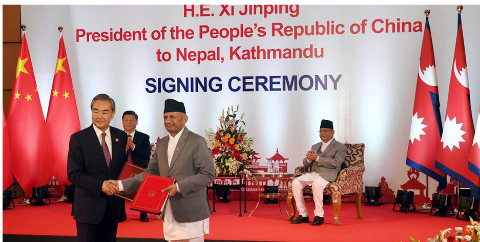
The Nepalese and Chinese foreign ministers exchange an agreement text in the presence of President Xi Jinping and Prime Minister K.P.Oli.

AN UNPRECEDENTED SECURITY CLAMPDOWN TOOK PLACE IN THE NEPALESE CAPITAL KATHMANDU PRIOR TO A VISIT BY CHINESE PARTY SECRETARY AND PRESIDENT XI JINPING'S IN OCTOBER, RAISING ALARM AMONG NEPALIS AND INCREASING CONCERN ABOUT THE FUTURE OF TIBETANS IN THE COUNTRY.