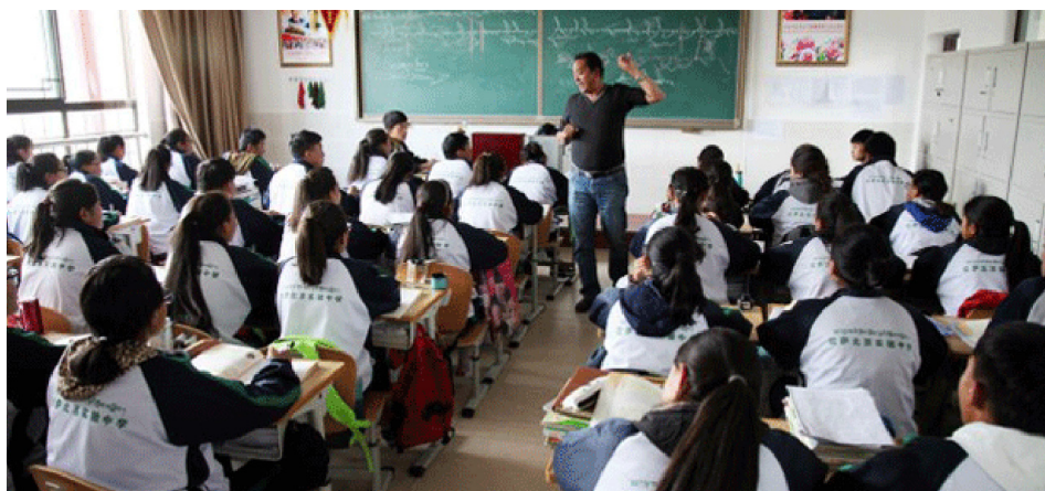
A classroom in a school in Tibet's regional capital Lhasa shown in a 2015 photo.

NEW JOB POSTINGS REVEAL THAT CHINESE AUTHORITIES ARE NOW REQUIRING COLLEGE GRADUATES FROM THE TIBET AUTONOMOUS REGION (TAR) APPLYING FOR JOBS IN PUBLIC INSTITUTIONS TO “EXPOSE AND CRITICIZE THE DALAI LAMA” AND “HAVE CLEAR AND FIRM POLITICAL PRINCIPLES.”