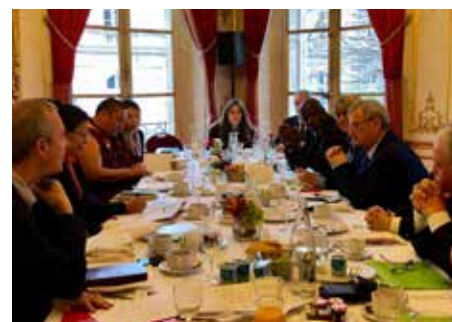
Members of the Tibetan Parliament in Exile exchange with the newly re-established French Senate's Tibet group during a working breakfast in the Senate on 15 November.

The visit was covered by a number of European media, including Belgian newspaper Le Soir and French newspaper Libération . ■