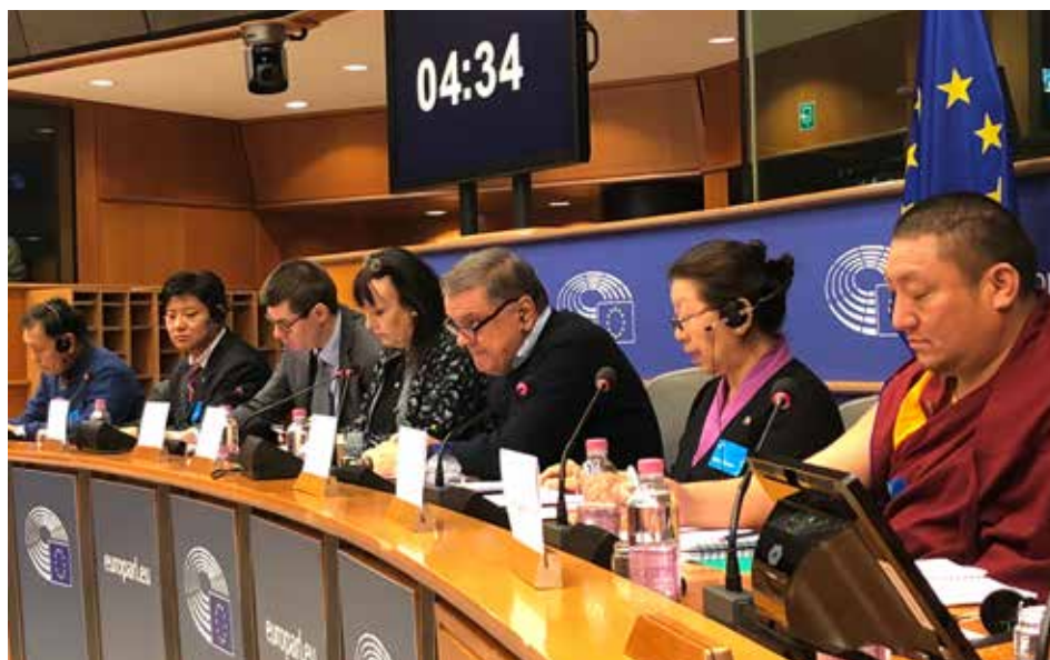
The delegation of the Tibetan Parliament in Exile during the exchange of views with the European Parliament's Subcommittee on Human Rights.

Between 11-30 November, ICT hosted a delegation of four members of the Tibetan Parliament in Exile on an advocacy tour in Europe.