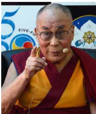
The Dalai Lama addressing the participants of the Five-Fifty Forum on 7 October.

Between 6-8 October, a number of ICT staff and board members participated in the Five-Fifty Forum, an international conference organised by the Department of Information and International Relations (DIIR) of the Central Tibetan Administration (CTA) in Dharamsala to discuss the future of the Tibetan movement.