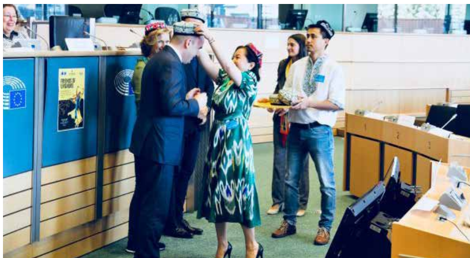
Members of the Uyghur community and of the newly-formed Uyghurs Friendship Group

situation and ensure that the issue remain high on the European political agenda.