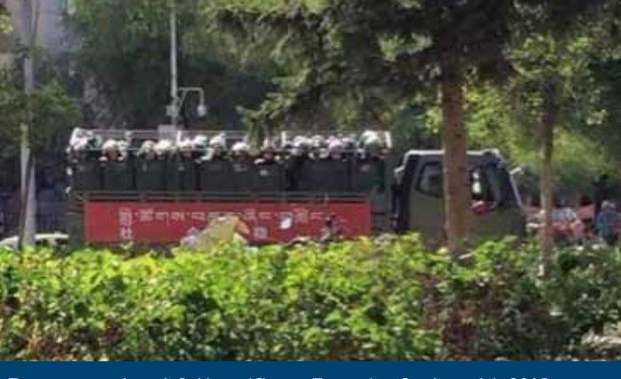
Troops moving through Rebkong (Chinese:Tongren) in Qinghai in July 2015.

There has been an intensification of security in the Tibet Autonomous Region, including an increased number of checkpoints, stepping up of surveillance and controls, and large-scale movement of troops in July. This is likely to be a part of the renewed emphasis on political 'stability' but also in the build-up to the 50<sup>th</sup> anniversary of the establishment by the Chinese authorities of the Tibet Autonomous Region.