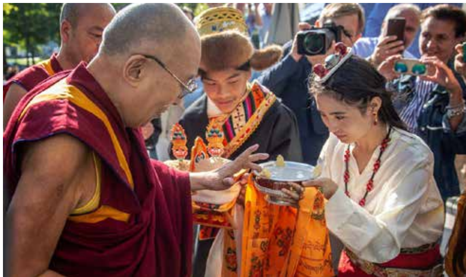
Members of the Dutch Tibetan community offering the Dalai Lama a traditional welcome at his arrival at his hotel in Rotterdam on 14 September.

ON 12 SEPTEMBER, 2018, THE DALAI LAMA ARRIVED IN SWEDEN FOR A 12-DAY EUROPEAN TOUR, WHICH ALSO TOOK HIM TO THE NETHERLANDS, GERMANY AND SWITZERLAND FOR A SERIES OF BUDDHIST TEACHINGS AND TALKS ON HAPPINESS, COMPASSION, PEACE AND NON-VIOLENCE. DURING HIS VISIT TO ROTTERDAM, ICT HAD THE HONOR TO CELEBRATE WITH HIM ITS 30 TH YEAR OF EXISTENCE.