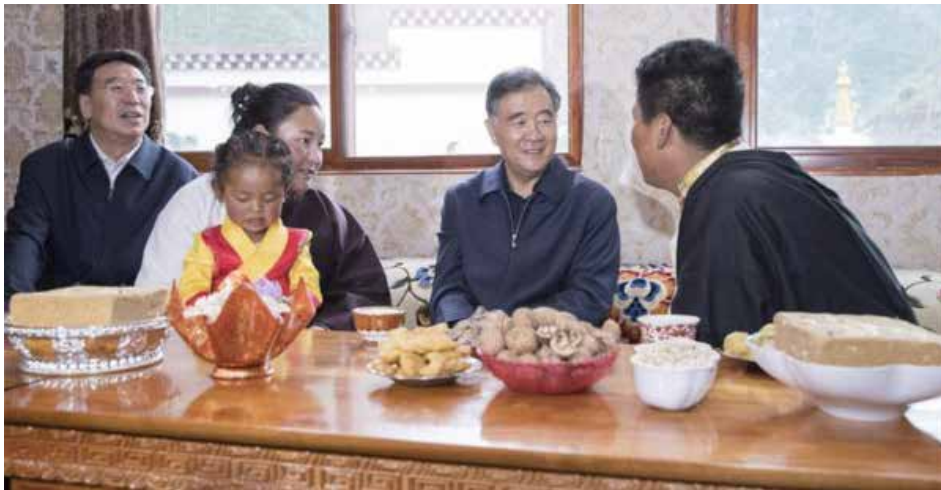
This image from Chinese state media shows top political advisor Wang Yang visiting a Tibetan family in Chamdo (Chinese: Qamdo), the Tibet Autonomous Region. During his visit, Wang Yang emphasized tightening controls over Buddhist religion.

CHINA HAS TIGHTENED THE SCREWS ON TIBETAN BUDDHISM, WITH ONE OF CHINA'S TOP LEADERS EMPHASIZING INCREASED COMMUNIST PARTY CONTROL OVER THE RELIGION. THIS TOOK PLACE A FEW DAYS AFTER THE CHINA-APPOINTED PANCHEN LAMA PRAYED AT A SACRED LAKE ASSOCIATED WITH THE SEARCH FOR THE DALAI LAMA'S REINCARNATION.