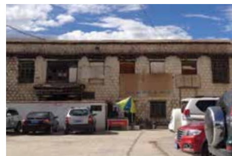
The area next to the Yabshi Taktser building, former home of the Dalai Lama's parents, was used as a car park and surrounded by malls. The building, now demolished, had fallen into disrepair and because of its associations with the Dalai Lama, vilified by the Chinese government, Tibetans were reluctant to raise concern or propose appropriate renovation.

THE FORMER HOME OF THE PARENTS OF THE DALAI LAMA, ONE OF THE LARGEST AND MOST IMPORTANT OF THE LAST REMAINING HISTORIC BUILDINGS IN LHASA, HAS BEEN DEMOLISHED AND A NEW CONCRETE STRUCTURE IS BEING BUILT IN ITS PLACE.