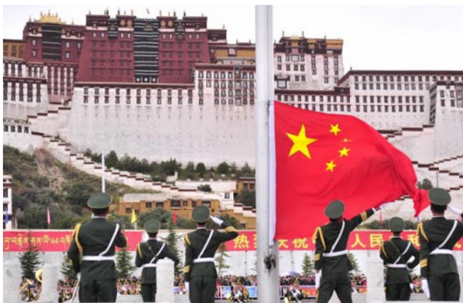
A flag-raising ceremony in Lhasa.

A NEW BRIEFING BY THE INTERNATIONAL CAMPAIGN FOR TIBET REVEALS HOW RECENTLY ADOPTED "ETHNIC UNITY" REGULATIONS IN TIBET WILL FURTHER ERODE TIBETANS' BASIC FREEDOMS AND VIOLATE THEIR HUMAN RIGHTS.