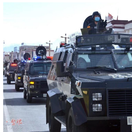
A massive show of military force in Lhasa on 6 March.

As Tibetans around the world commemorated the anniversary, the Chinese government made its continuing domination of their homeland clear with a massive show of military force . On 6 March, a joint military drill in central Lhasa, the capital of Tibet, brought out "combat-ready" troops of the People's Liberation Army, firefighters and officers from the People's Armed Police. The drill, which has almost become a ritual at this politically sensitive time of year, was held in the city despite almost empty streets due to China's ongoing political lockdown in Tibet, which has become even worse this year because of the coronavirus emergency, which has become even worse this year because of the coronavirus emergency.