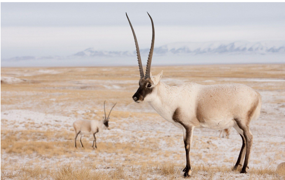
A Tibetan antelope or "Chiru".

TIBET'S BIODIVERSITY CHALLENGES PROVIDE INSIGHTS THAT CAN HELP SHAPE A PRACTICAL, INCLUSIVE AND ACCOUNTABLE GLOBAL BIODIVERSITY FRAMEWORK, THE INTERNATIONAL CAMPAIGN FOR TIBET SAYS IN A NEW BRIEFING PAPER.