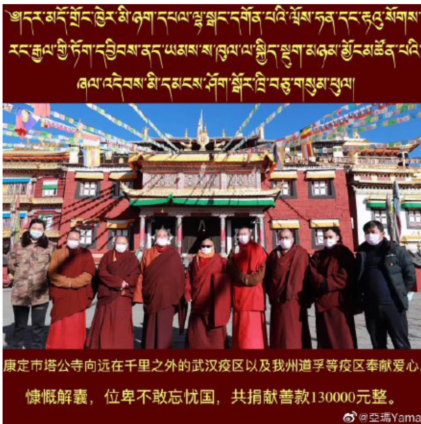
Monks of Minyak Pel Lhagang Monastery in Dhartsedo, Kham, in eastern Tibet. The words in Tibetan says they contributed RMB 130,000 as a gesture of solidarity with those in Wuhan and Tawu affected by the epidemic.

AS THE WORLD STRUGGLES TO CONTAIN THE SPREAD OF THE CORONAVIRUS, REPORTS REVEAL THAT CHINA HAS RESPONDED TO THE OUTBREAK IN TIBET BY CRACKING DOWN ON ONLINE POSTS ABOUT THE ILLNESS AND CANCELLING PUBLIC RELIGIOUS FESTIVALS AND PRAYER CEREMONIES.