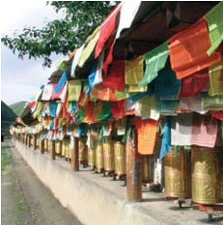
Tibetan prayer wheels and flags, believed to carry blessings in the wind.

Mythology, folklore and fiction have contributed to building an image of Tibet which is deeply