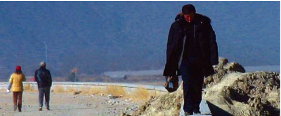
A Tibetan early in the laying of tracks for the world's highest altitude railway, running to Tibet from China. Most workers on the railroad were Chinese, with Tibetans doing largely unskilled manual labor.

Article Nine of the Chinese Constitution rules that all natural resources – from tress to coal to water and gold – are all the inalienable property of the state. China desperately needs all the natural and mineral resources it can exploit given its size and