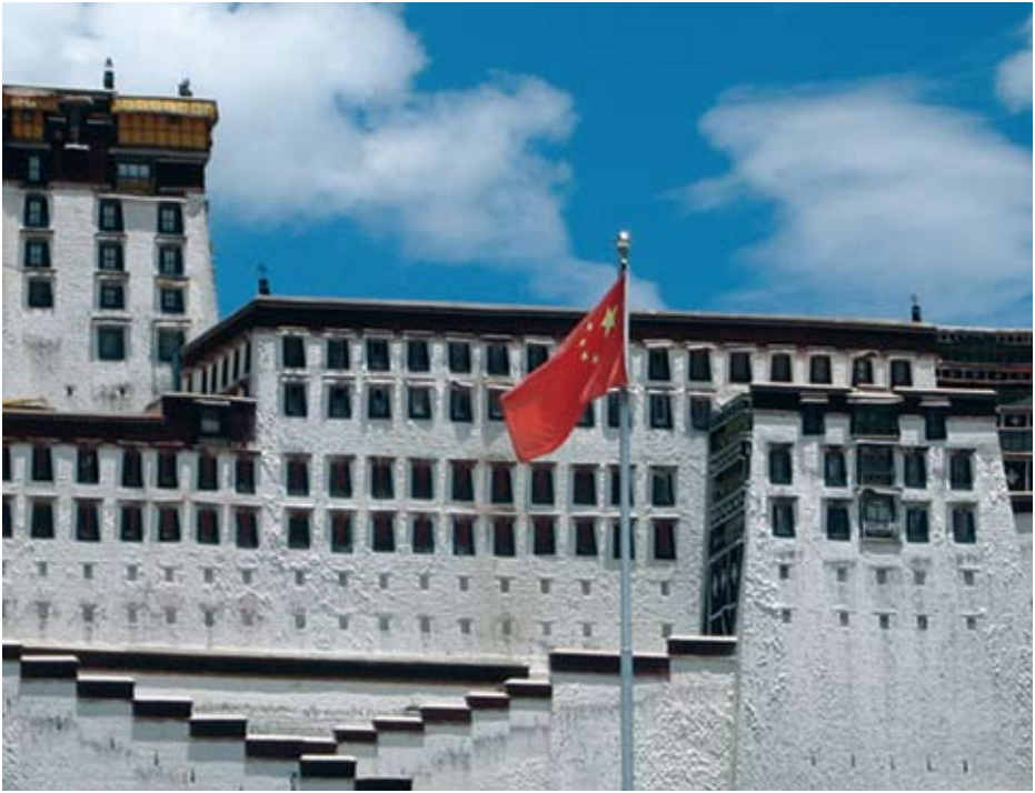
Chinese flag flying outside the Potala Palace; former home of the Dalai Lama in Lhasa.

Over the years, ICT has been repeatedly asked by independent travelers whether or not they should go to Tibet. The main concern is that by spending money in Tibet, tourists are worried they are supporting the regime which has been the cause of so much damage to Tibetan culture.