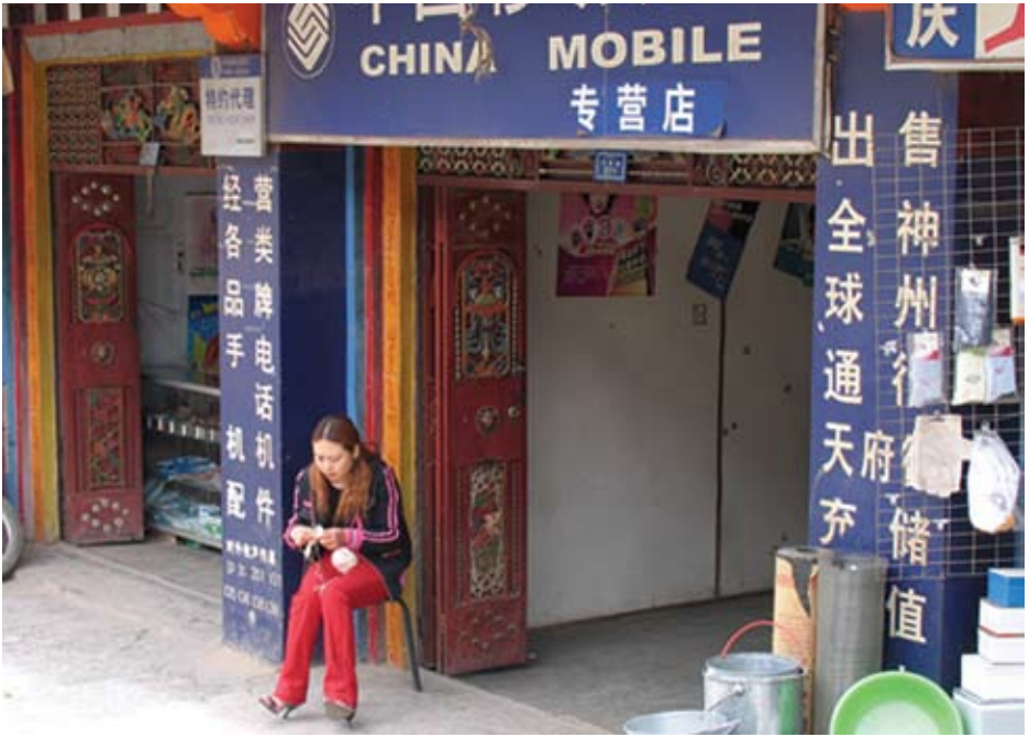
Chinese mobile phone store in Lhasa. Most new businesses are run by Chinese migrants looking for opportunities in Lhasa.

decision.” And as Wang Derong, a chief architect of China’s transportation planning told Fortune magazine in June 2006, a month before the line went into operation: “One of the most important reasons [for the railroad] is political stability. They [government officials] don’t try to hide that purpose.”