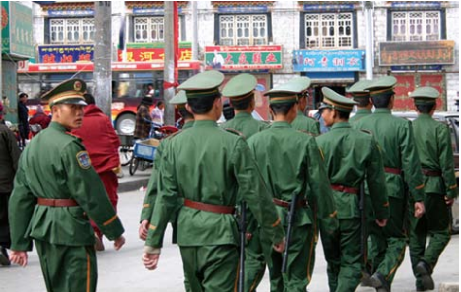
Chinese soldiers in Lhasa, 2006.

Dynasty and all other imperial dynasties were founded on the Mandate of Heaven – that the emperor of China was heaven-ordained – and even that some Qing emperors in Beijing revered the Dalai Lamas in distant Tibet. Nor do they stress the fact in this context that the Chinese government advocates atheism and dismisses many religious practices as “superstition”.