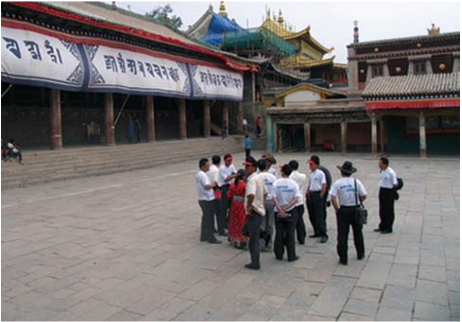
Tour group visiting Kumbum. With the resurgence of religion in China, Tibet has seen a dramatic increase in Chinese tourists visiting monasteries and holy places .