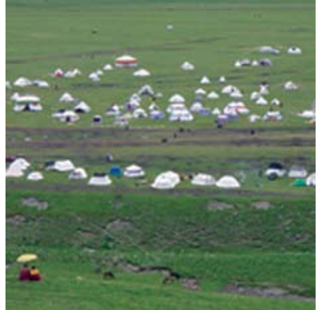
A religious encampment in the eastern Tibetan area of Kham, now incorporated into China's Sichuan province. Given the increased restrictions and control of religious practice in monasteries and nunneries, more Tibetans are attempting to connect directly with religious teachers and their practice in encampments outside more established monastic institutions.

According to China's official statistics 2.5 million tourists (mostly Chinese) went to Tibet in 2006, which was an increase of over 40% on the previous year. Official estimates claim as many as 4 million tourists will visit Tibet in 2007, a figure which Tibet's tourism bureau concedes is likely to put