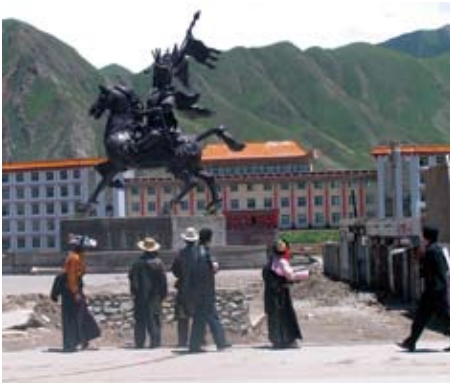
Statue of King Gesar, a legendary warrior famous throughout Central Asia, remains a cultural icon in modern Tibet. This statue is in the Tibetan area of Jyekundo, capital of Yushu Prefecture.

Tibetans has uncomfortable similarities with the inflammatory language of the Cultural Revolution. (It should be noted that the word ‘propaganda’, which has negative and almost Stalinist connotations in English and other languages, is largely synonymous with the term ‘marketing’ in Chinese and is widely used.)