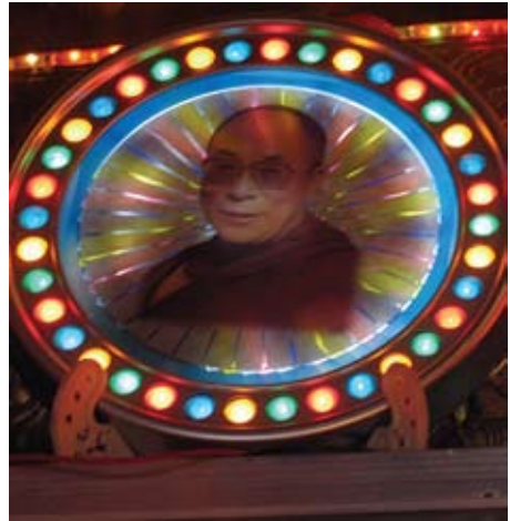
A secret image of the Dalai Lama on a shrine in eastern Tibet.

— Zhang Qingli, TAR Chinese Communist Party Secretary, August 16, 2006.