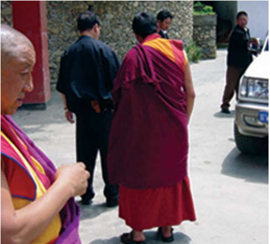
The presence of security personnel at monasteries and nunneries is particularly visible during political and patriotic education campaigns as in this photo taken at a Tibetan monastery in Sichuan province (a gun holder is visible on the belt of one of the security officials).