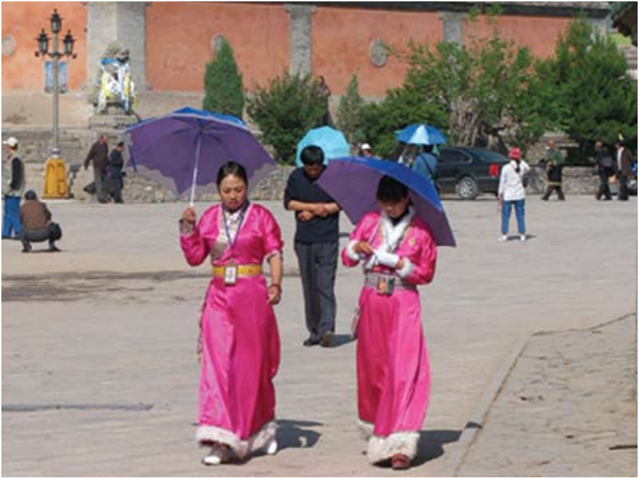
Tourists in Tibetan dress at Kumbum monastery in Amdo, now part of Qinghai province. Chinese tourists are more and more attracted to Tibet's exotic culture and frequently dress in Tibetan outfits on visits to monasteries.

The behavior of foreigners has on occasion been the cause of Tibetans being detained, formally arrested and imprisoned. Remember, you will be traveling in what is effectively a police state with a tense political climate. While tour guides can expect – and are trained – to field all sorts of difficult political questions, you are urged to use common sense and to simply not raise any sensitive topics with ordinary Tibetans, particularly if your conversation can be overheard.