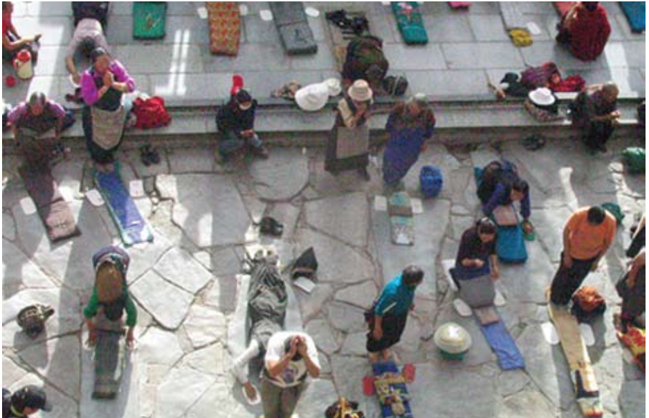
Tibetan pilgrims at the Jokhang Temple in Lhasa.

have committed themselves, is to vow to honor without the slightest reservation their religious teacher – the Dalai Lama. Once that most solemn vow is broken, Tibetans believe, it can never be repaired. Recognizing their anguish, the Dalai Lama has advised that because of the dangers they face if they fail to denounce him, Tibetans should simply do so and hold their loyalty to him in their heart instead.