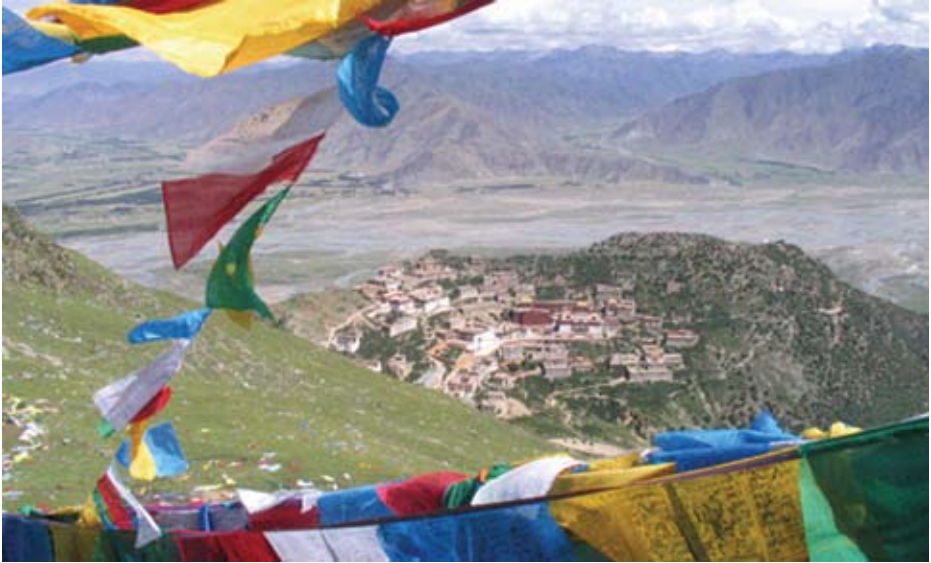
Tibetan prayer flags near Ganden Monastery.

there before they set out on their journey – at least, as aware as they could be in light of the authorities’ attempts to block information flow on Tibet. It is notable that there are very few accounts of travel to Tibet by non-Chinese writers in the last 50 years and more which do not dwell on the Chinese state’s oppression of the Tibetan people and the destruction of Tibetan culture.