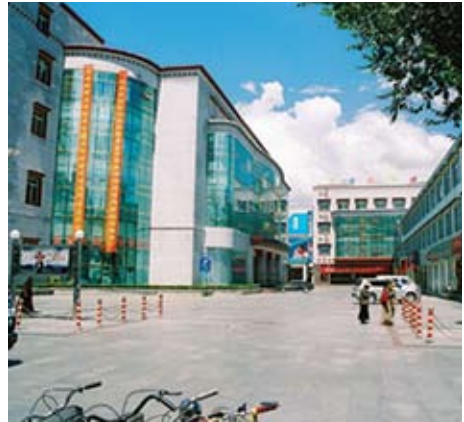
Lhasa is fast becoming a modern Chinese city, at the expense of local Tibetans.

In Lhasa, travelers prepared to observe more closely will see the beggars on the streets, the pervasive presence of the Chinese military, and note too that most of the traders are actually Chinese rather than Tibetan. A harmless looking radio transmitter is actually there to jam Tibetan language broadcasts from foreign radio stations such as Voice of America, Voice of Tibet and Radio Free Asia. The ornate curlicues on the façade of a building may be in the Tibetan style, but they cannot hide the absence of genuine Tibetan architecture – less than three per cent of the 'Tibetan quarter' of Lhasa remains following the demolition and transformation of Lhasa into a Chinese city.