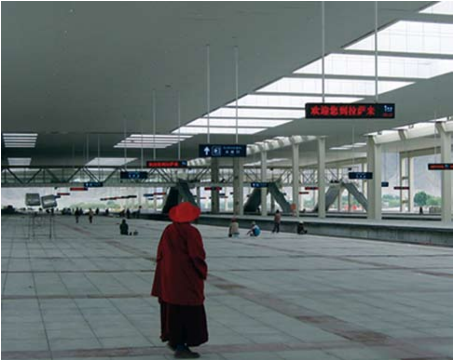
A woman stands on the platform of the new Lhasa railway station. The arrival of the railway to Lhasa has changed the face of tourism in Tibet. Each platform is more than eight meters wide - approximately the width of three trucks parked next to each other.

rate of development, and Tibet is an important part of that bigger picture.