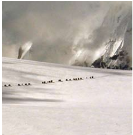
Tibetan herders move yaks across the Nangpa Pass, a route well traveled by Tibetan refugees heading across the Himalayas to Nepal.

According to ICT’s sources, as of 2006 there actually appeared to be more people taking the pilgrimage to Lhasa than at any other time in recent history. However, this apparent relaxation on one aspect of religious devotion in Tibet needs to be understood in the broader context of the Chinese government and communist party’s practices and policies.