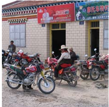
Nomads on motor-bikes in an area of Amdo, eastern Tibet, now incorporated into Qinghai province. Under Chinese policies of urbanization, more and more Tibetan nomads are required to settle in towns.